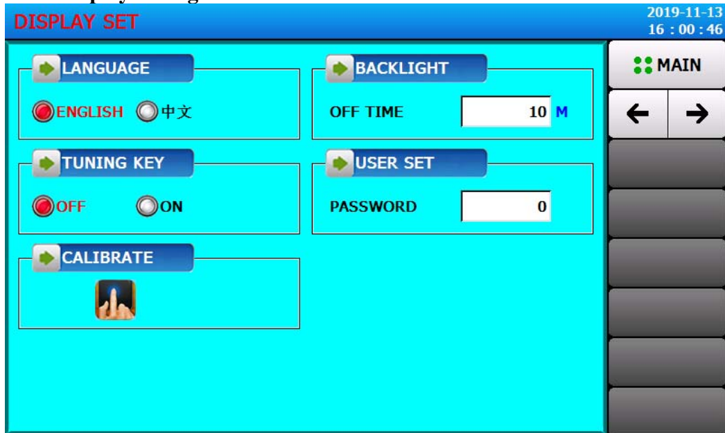
[Figure 7-1] Screen display settings